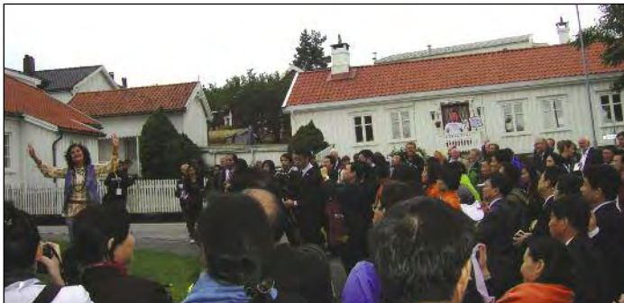
Chinese guests enjoy the outdoor Grenland Theatre Cultural Event in Porsgrunn.

Our 2 nd seminar for 2009 was held in cooperation with the Hubei-Norway Week 2009 event which was held from Sept 7-10, 2009 in Telemark. 100 Chinese guests from Hubei Province as well as approx. 40 European guests from friendship regions to Hubei province participated