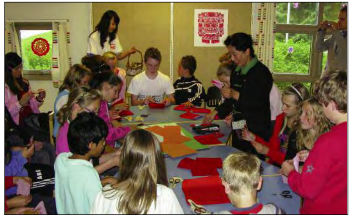
Chinese paper cutting exhibition at Porsgrunn library.

The excellent cultural events took place during the week. Many hundreds of Norwegians watched spectacular Kung Fu performers, enjoyed the 'Chinese Paper Cuttings' exhibition that took place at the Porsgrunn Library and a special cultural exhibition at Porsgrunn High School.