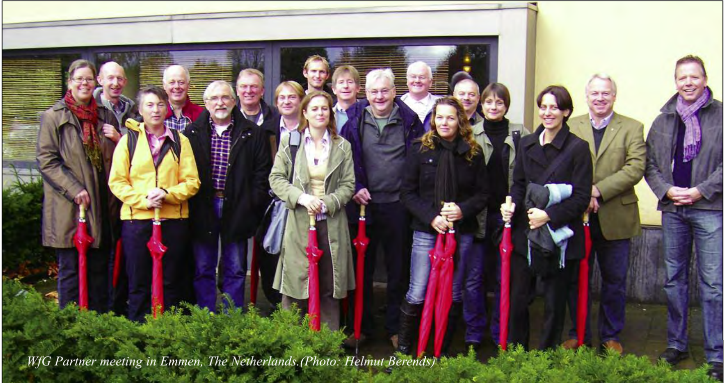
WfG Partner meeting in Emmen, The Netherlands.

musical events in Kragerø and on the island of Skåtøy in the years to come. Kragerø municipality's culture and business development teams cooperate closely with the song writers/poets at Skåtøy and hopefully this can lead to some annual events after the project period is completed in 3 years.