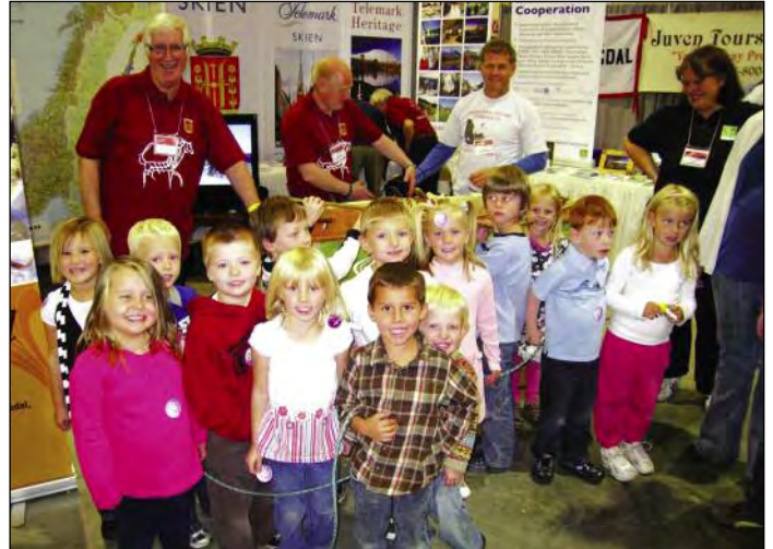
A kindergarten class visits the Telemark stand at the Norsk Høstfest in Minot, ND.

We had many visitors who came to see the ‘Telemark’ stand we set up at Norsk Høstfest in Minot, and to ask