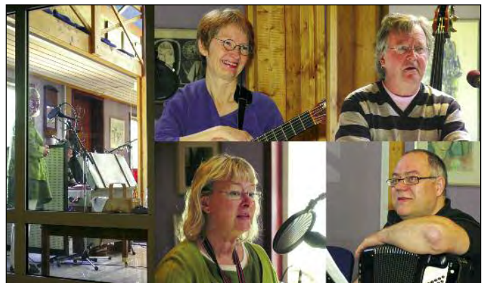
An array of Scandinavian musicians will perform in the project initiative 'Maritime Toner'.

One of the activities is the project called 'Maritime Toner' and will include a number of smaller concerts and