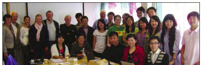
Chinese student volunteers at Telemark University College.