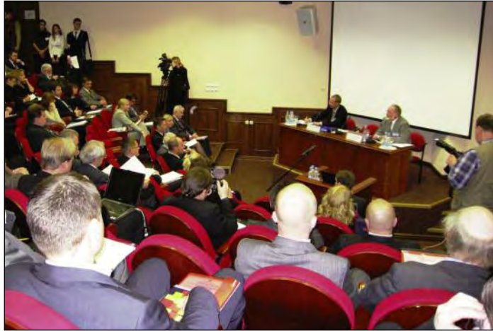
Arkhangelsk Maritime Partenariat participants.

Sevmash, Russia's largest shipping company Sovcomflot and Rosmorport, the agency responsible for harbor construction and infrastructure in Russia.