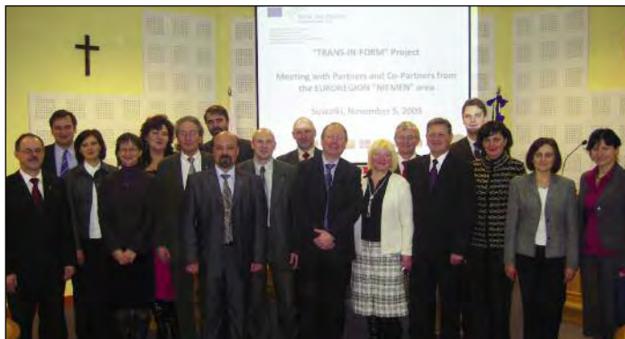
Trans In Form project participants at Suwalki, Poland meeting.

The Trans in Form project has a total budget of NOK 15 million. International expert assistance and new ideas will be given to small towns, cities and regions in 9 European countries. In cooperation with local stakeholders and politicians, we expect to achieve increased attractiveness and awareness to town/city development, architecture and design. Various places and regions in Europe will learn from each other and develop joint pilot projects. Notodden municipality is the initiative taker and lead partner.