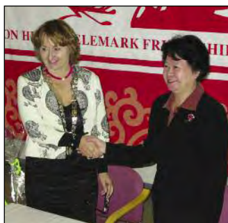
Telemark Province Mayor Gunn Marit Helgesen welcomes Vice Governor of Hubei, Mrs. Zhang Dali

Hubei Province had invited their European partners to join a round table meeting for sustainable cooperation between Hubei Province and European regions. The meeting was held at Porsgrunn City Hall on September 7, 2009. China and several European countries (Norway, France, Holland, Spain, Sweden and Germany) attended this significant conference.