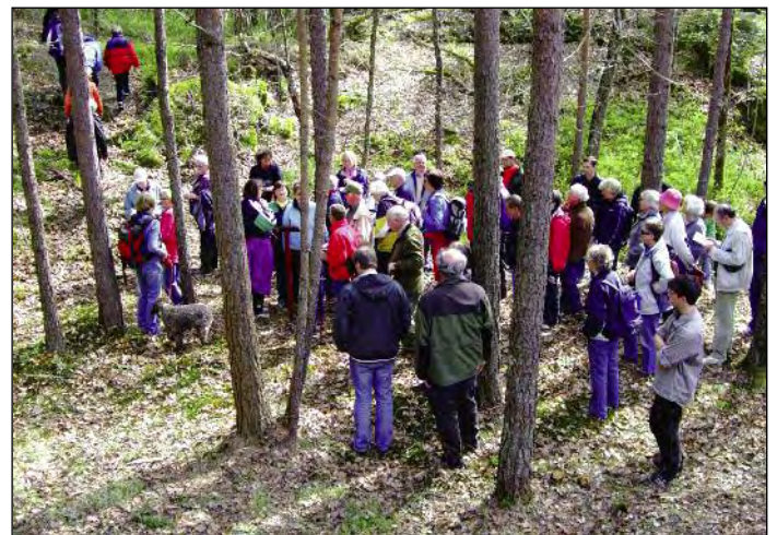
Opening of the trail 'From Ice Age to Ice Age'.

Description of some of the activities that have taken place in Bamble and Kragerø: