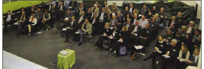
Open Days Local Event 2009 Klosterøya seminar participants.

The event took place on October 20 th in inspiring surroundings on Klosterøya in the City of Skien, an island with a fascinating history with a number of global industrial eras, now in the process of being transformed