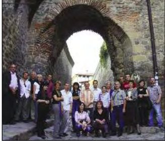
Seminar participants learning more about the ancient town of Plovdiv in Bulgaria.

Telemark fylkeskommune's International Team, Telemark County Council, Fylkeshuset, 3706 Skien, Norway. Tel.: +47 35 58 42 00 – Fax: +47 35 52 99 55 www.telemark.no/international Editor: Dawn Syvertsen, dawn.syvertsen@t-fk.no