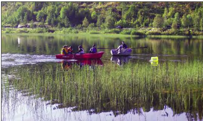
The Ecotourism delegation from Hubei Province experiences some environment friendly recreational activities in Morgedal.

representing the sectors of Environmental technology and CO2 solutions, Cluster building and Information security, Health and Ecotourism. Go to www.norway-hubei.net and/or to the article about Telemark and Hubei Province Friendship Agreement further in this bulletin. Our next seminar on internationalization will be held from June 4-5, 2010 in Langesund in connection with the Langesund Shanty Festival. www.lmsf.no .