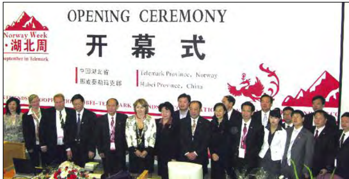
Telemark Province Mayor Gunn Marit Helgesen with Hubei Province VIP delegation.